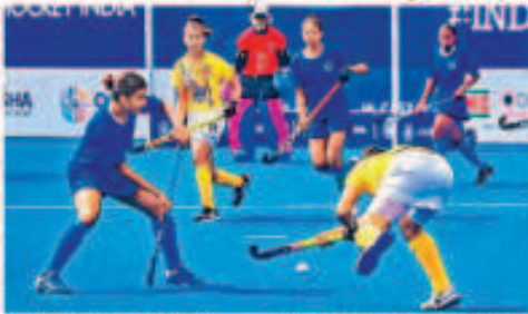
खिड़ी की तीसरे क्वार्टर में हैट्रिक हरियाणा ने बंगाल को 10-4 से हराया, दिल्ली के 4 गोल्, टीम को फिनिश लक्वायर घुसरी ली। हरियाणा ने बंगाल को 10-4 से हराया, दिल्ली के 4 गोल्, टीम को फिनिश लक्वायर घुसरी ली।

लखनऊ, 27वीं अगस्त को हरियाणा ने बंगाल को 10-4 से हराया, दिल्ली के 4 गोल्, टीम को फिनिश लक्वायर घुसरी ली। हरियाणा ने बंगाल को 10-4 से हराया, दिल्ली के 4 गोल्, टीम को फिनिश लक्वायर घुसरी ली। हरियाणा ने बंगाल को 10-4 से हराया, दिल्ली के 4 गोल्, टीम को फिनिश लक्वायर घुसरी ली।