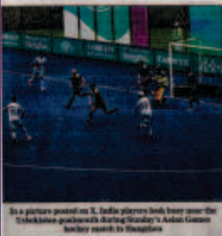
In a picture postcard as X, India players look happy over the 10-2 victory over South Korea during Sunday's Asian Games hockey match in Hangzhou.

SHAN GAMES HOCKEY INDIA 14 South Korea 2 Shanghai: Last Tuesday, Hangzhou and Shanghai were the scene of a goal-fest as India started their men's hockey campaign at the Asian Games with a 10-2 rout of level-ranked South Korea. Ranked third in the world, India began the match as clear favourites against the world No. 40 South Korea side. The proceedings from start to finish in the Pool A match. Last (10), 200, 270, 300, and 330, 360, 390, 420, 450, 480, 510, 540, 570, 600, 630, 660, 690, 720, 750, 780, 810, 840, 870, 900, 930, 960, 990, 1020, 1050, 1080, 1110, 1140, 1170, 1200, 1230, 1260, 1290, 1320, 1350, 1380, 1410, 1440, 1470, 1500, 1530, 1560, 1590, 1620, 1650, 1680, 1710, 1740, 1770, 1800, 1830, 1860, 1890, 1920, 1950, 1980, 2010, 2040, 2070, 2100, 2130, 2160, 2190, 2220, 2250, 2280, 2310, 2340, 2370, 2400, 2430, 2460, 2490, 2520, 2550, 2580, 2610, 2640, 2670, 2700, 2730, 2760, 2790, 2820, 2850, 2880, 2910, 2940, 2970, 3000.