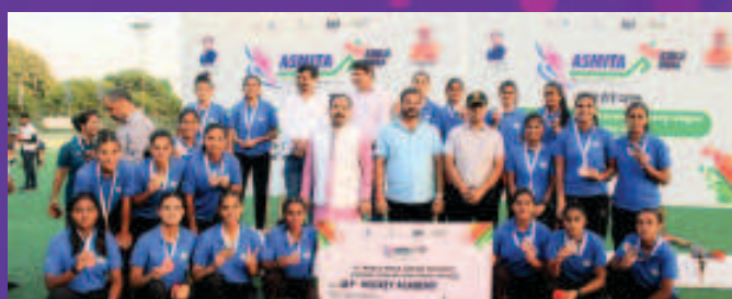
MADHYA PRADESH HOCKEY ACADEMY