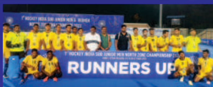
UTTAR PRADESH HOCKEY