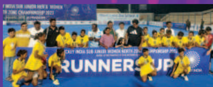
UTTAR PRADESH HOCKEY