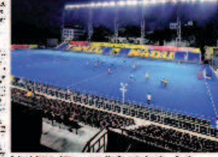
A large stadium at night is filled with spectators, with bright lights illuminating the field.