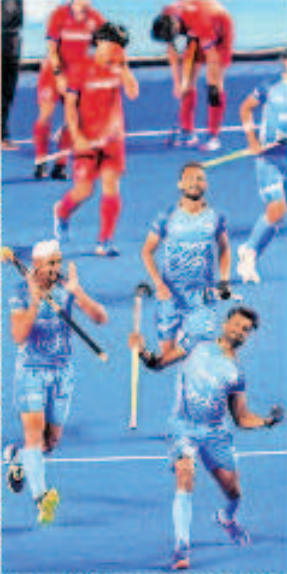
India players celebrate their victory over the Netherlands in the quarter-finals of the World Cup.