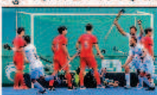
भारतीय पुरुष हॉकी टीम कोरिया को हराकर फाइनल में प्रवेश कर रही है।