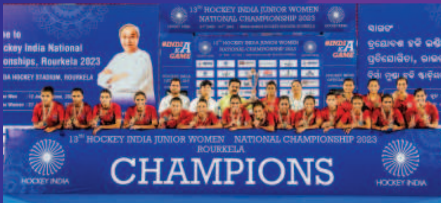
HOCKEY MADHYA PRADESH