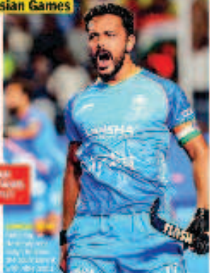
ACTIAN The team's success was a result of the hard work and dedication of the players and staff. The team's performance was a testament to their skill and determination.