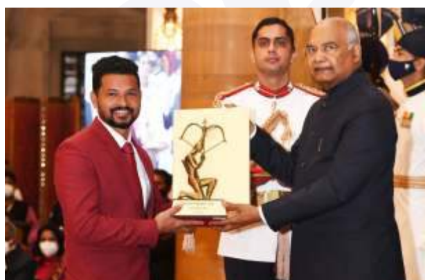
Birendra Lakra - Arjuna Award