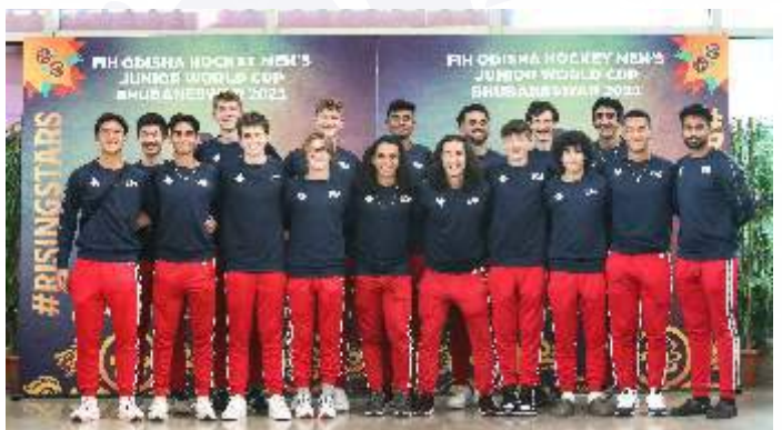
TEAM UNITED STATES