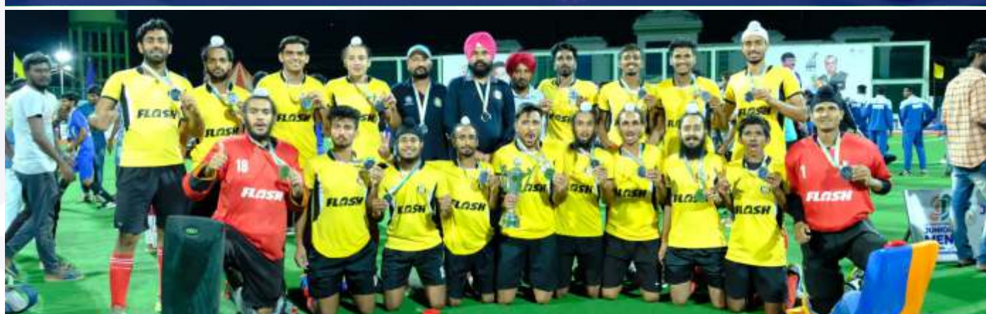
Silver Medalist - Hockey Chandigarh