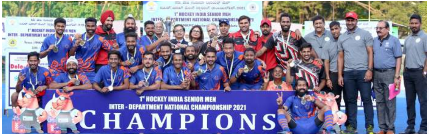
Gold Medalist - Petroleum Sports Promotion Board

In the 1st Hockey India Senior Men Inter-Department National Championship 2021 in Bengaluru, Karnataka. Petroleum Sports Promotion Board were crowned as the champions in the tournament after they picked up a thrilling 2- 1 victory over Railway Sports Promotion Board in the final. Punjab National Bank edged out Sports Authority of India 6-2 to earn the 3rd place finish.