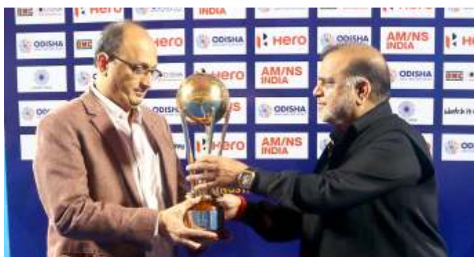
Sandip Pradhan, DG SAI