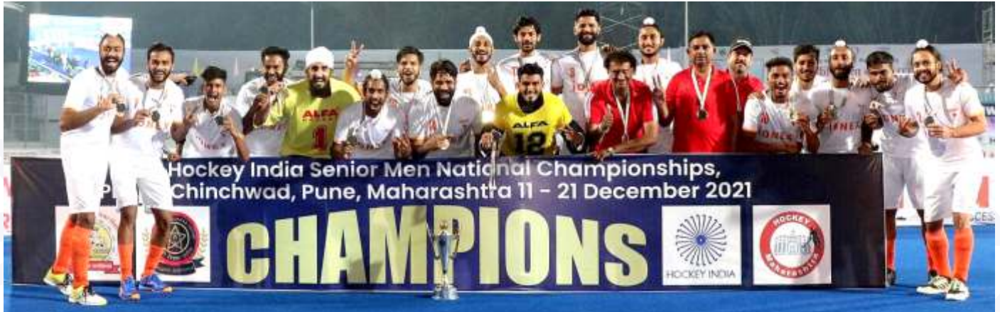
Gold Medalist - Hockey Punjab

Hockey Punjab were crowned as the Champions of the 11th Hockey India Senior Men National Championship Pimpri Chinchwad 2021 beating Uttar Pradesh Hockey 2-1 in a shootout to clinch the trophy in Pune. Meanwhile, Hockey Karnataka beat Hockey Maharashtra 5-2 to finish third in the tournament.