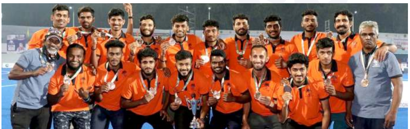
Bronze Medalist - Hockey Karnataka