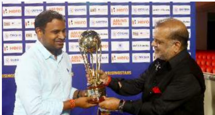
Tusharkanti Behera Honourable Minister Sports and Youth Services