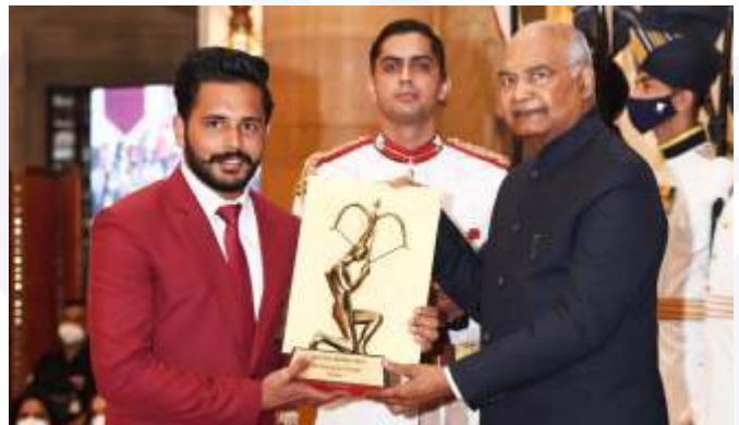
Harmanpreet Singh - Arjuna Award