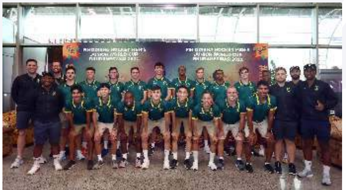
TEAM SOUTH AFRICA