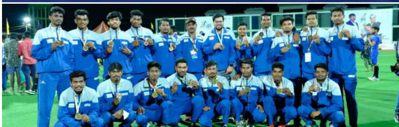
Bronze Medalist - Hockey Association Of Odisha