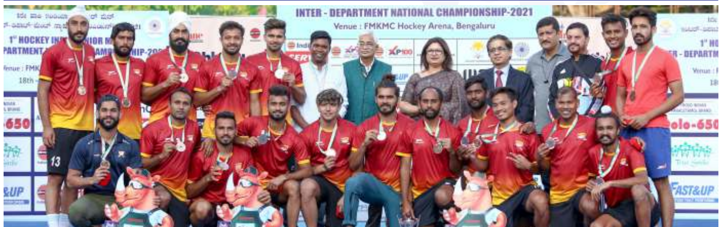
Bronze Medalist - Punjab National Bank