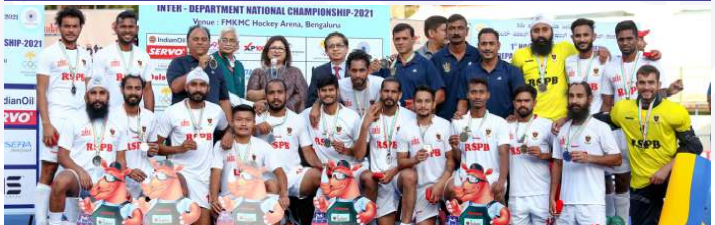
Silver Medalist - Railway Sports Promotion Board