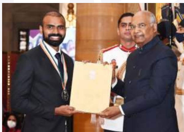
Sreejesh Parattu Raveendran Major Dhyan Chand Khel Ratna Award