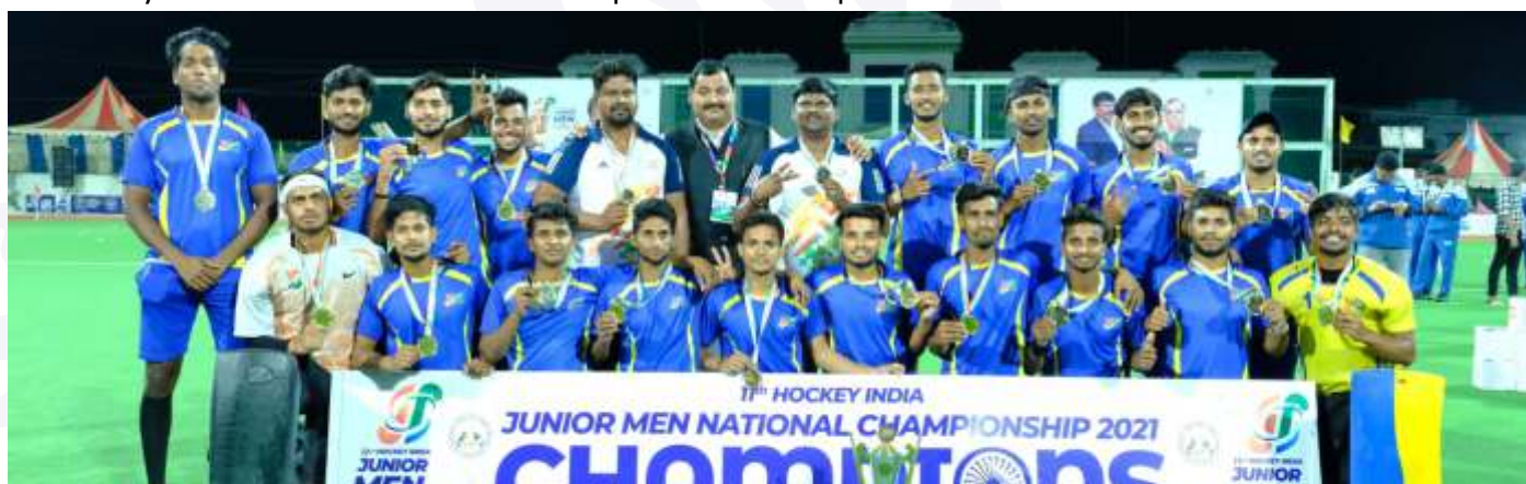
Gold Medalist - Uttar Pradesh Hockey

In the 11th Hockey India Junior Men National Championship 2021, Kovilpatti, Tamil Nadu, Uttar Pradesh Hockey maintained their 100% record with a decisive 3 - 1 victory over Hockey Chandigarh in the Final of the competition. In the 3rd/4th Place playoff match, Hockey Association of Odisha edged out Hockey Haryana 3 - 2 in a closely contested affair to clinch the 3rd place in the competition.