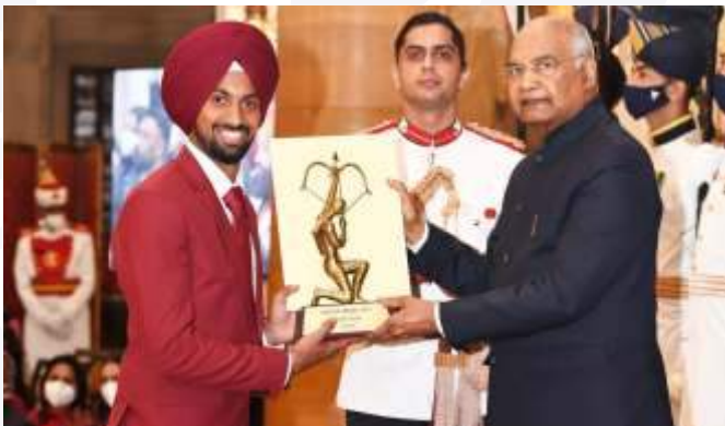
Hardik Singh - Arjuna Award