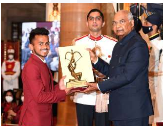
Vivek Sagar Prasad - Arjuna Award