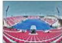
View of Kalinga Hockey Stadium.

All 16 participating teams including Pakistan, which are camping in Bhubaneswar city, are getting ready to battle it out for top honours at the tournament. The players and team officials are being housed in a bio-secure bubble given the Covid-19 situation, officials said on Tuesday. The twin city Police Commissioner has