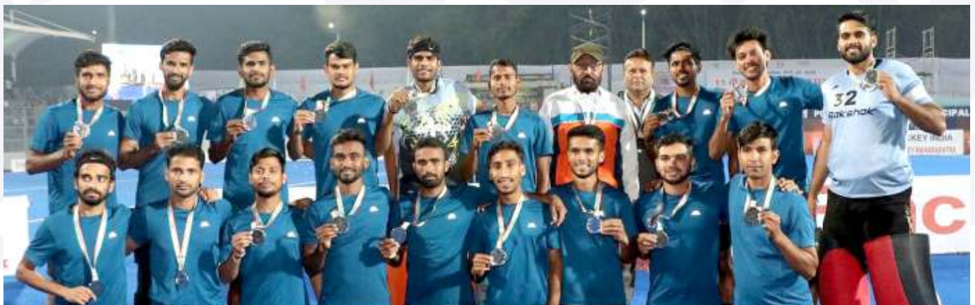
Silver Medalist - Uttar Pradesh Hockey