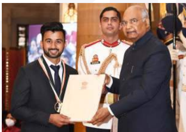
Manpreet Singh Major Dhyan Chand Khel Ratna Award

Hockey India on 03 November 2021 congratulated experienced Indian Men's Hockey goalkeeper PR Sreejesh and Skipper Manpreet Singh on being conferred with the prestigious Major Dhyan Chand Khel Ratna Award, the highest honour for a sportsperson in India. While Sreejesh had an exceptional outing at the Tokyo Olympic Games and was also awarded the FIH Goal Keeper of the Year award 2020-21 for his exploits guarding India's post in the team's Olympic Bronze medal winning feat, Manpreet Singh Captained the Indian Men's Hockey team which successfully ended India's 41-year-long wait to win an Olympic medal in field hockey.