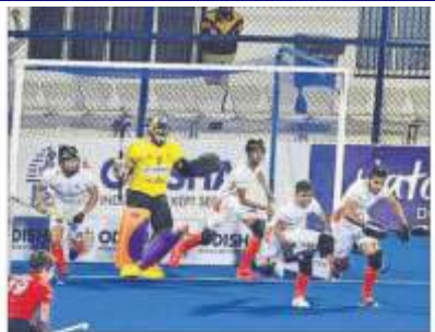
Indian players defend a penalty corner during their match against France at Bhubaneswar on Sunday.