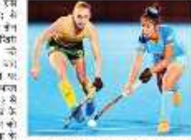
Two hockey players competing for the ball during a match.

The Hockey Federation of India has been working for the last few months to get ready to host the Asian Champions Trophy. The Hockey Federation of India has been working for the last few months to get ready to host the Asian Champions Trophy.