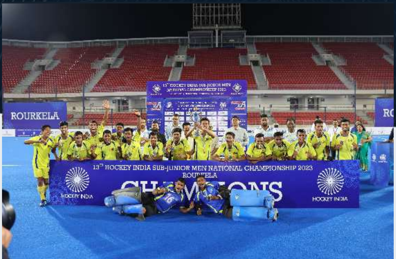
UTTAR PRADESH HOCKEY

The 3rd/4th place match saw Hockey Haryana claim a 4-2 comeback win over Hockey Madhya Pradesh.