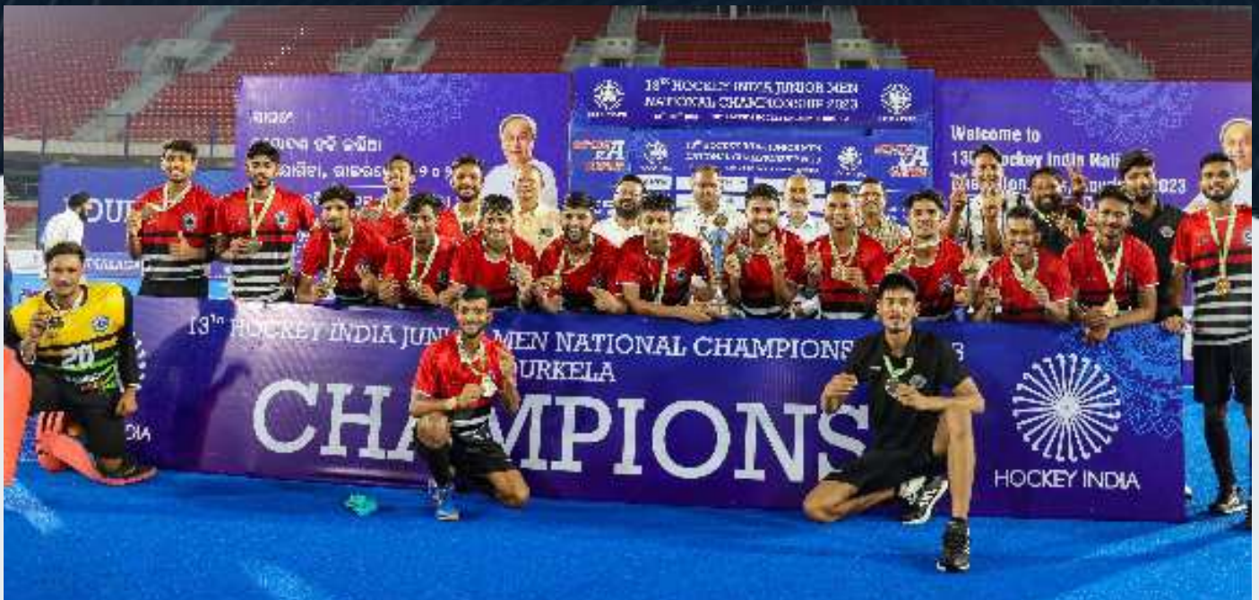
HOCKEY MADHYA PRADESH

Eventually, Hockey Madhya Pradesh won the 13th Hockey India Junior Men National Championship 2023 after defeating Hockey Chandigarh (4-2) in the Final at the iconic Birsa Munda Hockey Stadium.