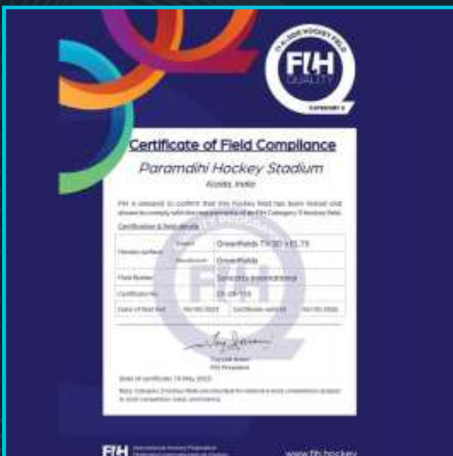
Congratulations to the Paramdih Hockey Stadium, Koida, India, for receiving the FIH Category 3 field certificate based on its construction, performance, and player welfare requirements.