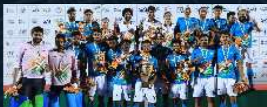
M D UNIVERSITY, HARYANA