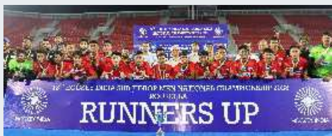
HOCKEY ASSOCIATION OF ODISHA