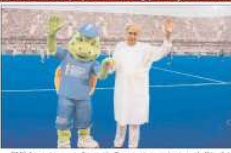
Odisha Hockey Federation officials and mascot during a ceremony.

The Odisha Cabinet has approved the proposal for extension of sponsorship agreement of both the men and women Indian national hockey teams (men and junior) for a further period of ten years (i.e., from 2023 to 2033). The state has been the official sponsor of both the men and women national hockey teams since 2008. This support is going to be a significant step towards the growth and development of hockey in India. The Cabinet also approved 14 other proposals including promulgation of ordinance for amendment to OSEBC Act-1993.