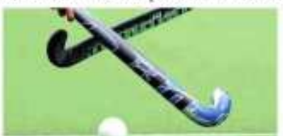
Teams in the preliminary round will play in a round-robin format in their respective pools with the top two finishers in each group qualifying for the knockout stages. The final will be played on June 1.

Hockey India's preliminary round for the men's Junior Asia Cup 2023 is set to begin in Delhi on May 27. The tournament will feature 12 teams, with India and Pakistan in the same pool. The preliminary round will be held in a round-robin format, with the top two teams from each group qualifying for the knockout stages. The final will be played on June 1.