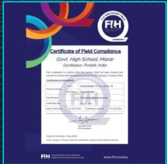
Congratulations to the Govt. High School, Marar, Gurdaspur, Punjab, India, for receiving the FIH Category 2 field certificate based on its construction, performance, and player welfare requirements.