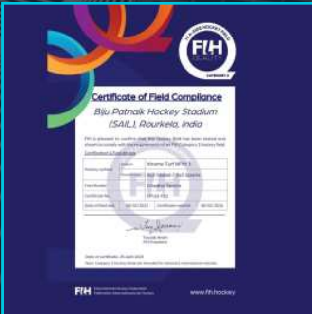
Congratulations to the Biju Patnaik Hockey Stadium (SAIL), Rourkela, India, for receiving the FIH Category 2 field certificate based on its construction, performance, and player welfare requirements.