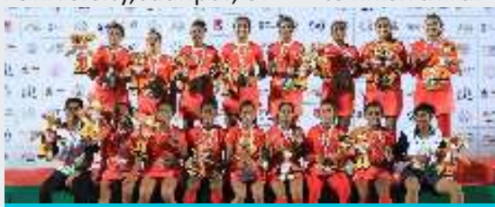
GURU NANAK DEV UNIVERSITY, AMRITSAR

Sambalpur University, Odisha defeated Veer Bahadur Singh Purvanchal University, Jaunpur, UP 2-1 to finish third.