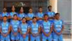
India's Junior women's hockey team for Junior Asia Cup 2023.

The Hockey Federation of India has been working for the last few months to get ready to host the Asian Champions Trophy. The Hockey Federation of India has been working for the last few months to get ready to host the Asian Champions Trophy.