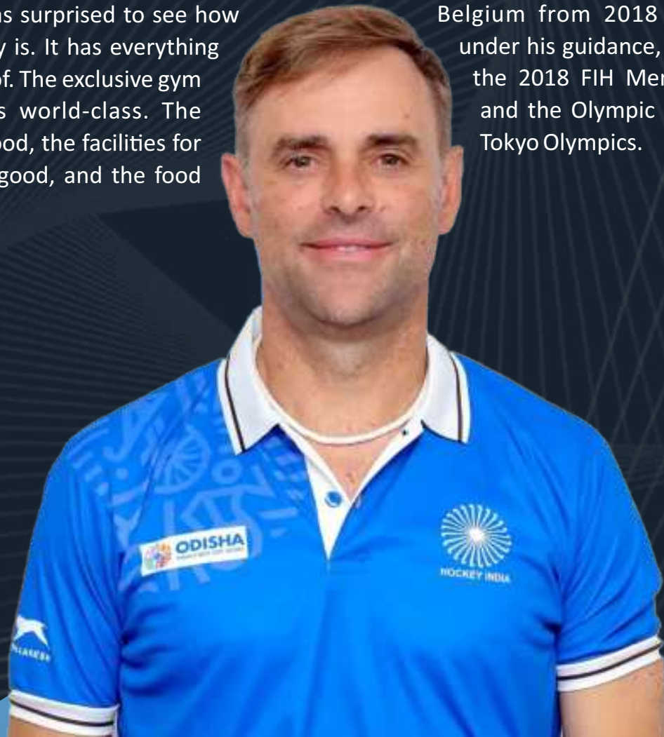
CRAIG FULTON'S INDIAN MEN'S HOCKEY TEAM'S CHIEF COACH

Interestingly, Craig has nearly 25 years of coaching experience. He worked with Belgium from 2018 to 2021 and under his guidance, the team won the 2018 FIH Men's World Cup and the Olympic Gold medal in Tokyo Olympics.