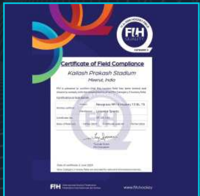
Congratulations to the Kailash Prakash Stadium, Meerut, India, for receiving the FIH Category 2 field certificate based on its construction, performance, and player welfare requirements.