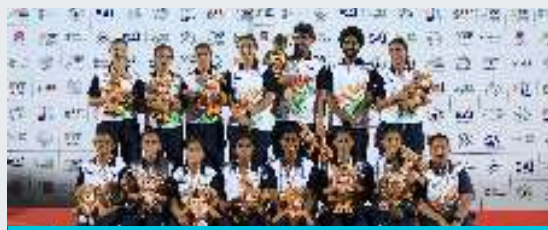
SAMBALPUR UNIVERSITY, ODISHA