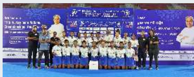
HOCKEY ASSOCIATION OF ODISHA