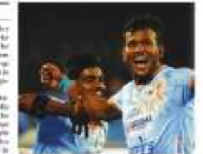
Indian hockey team players celebrating a victory.

The Hockey Federation of India has been working for the last few months to get ready to host the Asian Champions Trophy. The Hockey Federation of India has been working for the last few months to get ready to host the Asian Champions Trophy.