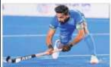
The Indian captain sees Asian Champions Trophy as a stress rehearsal for the upcoming Asian Games later in the year.

"This will be an ideal tournament for us to see where we stand against the same teams with whom we will be competing in the Asian Games. It will be a litmus test for the team ahead of the Asian Games. It will also give us a good understanding of our opponents and we can better prepare well for the Asian Games where we aim to win the gold medal and qualify for the Paris 2024 Olympics," he added.