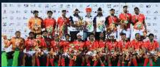
I.T.M UNIVERSITY, GWALIOR