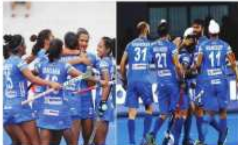
India hockey men's and women's team