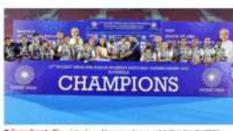
Triumphant: The victorious Haryana team.

The Hockey Federation of India has been working for the last few months to get ready to host the Asian Champions Trophy. The Hockey Federation of India has been working for the last few months to get ready to host the Asian Champions Trophy.