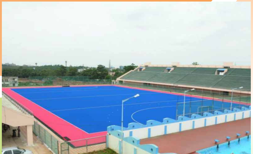
Look of newly constructed Blue Astro turf Hockey Stadium at Bhubaneswar