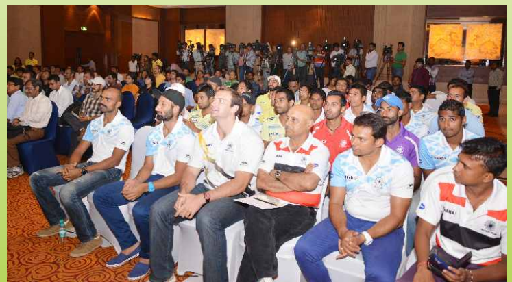
Senior Men Team attending felicitation ceremony of Junior Women team.