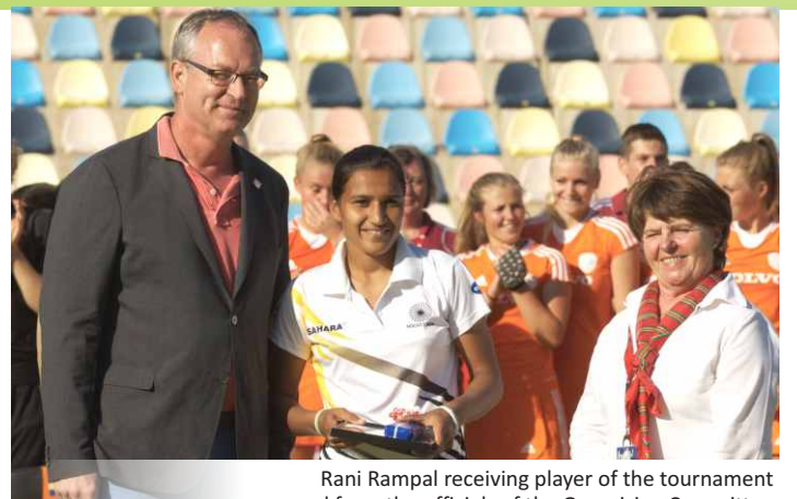
Rani Rampal receiving player of the tournament award from the officials of the Organising Committee

Indian forward and Vice-Captain Rani Rampal was declared the Best Player of the FIH Junior Women Hockey World Cup 2013. Rani who comes from a small village in Shahbad in Haryana performed remarkably in all the six games played in the tournament. She scores four goals for her team, played a crucial role in the 3 rd /4 th place play-off match, as she scored one field goal in the regulation time and two goals in the shoot-out.