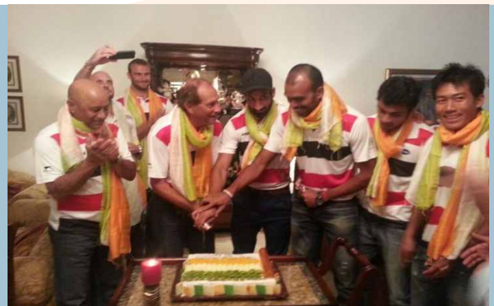
Players and support staff of the Senior Men team celebrating Independence Day.