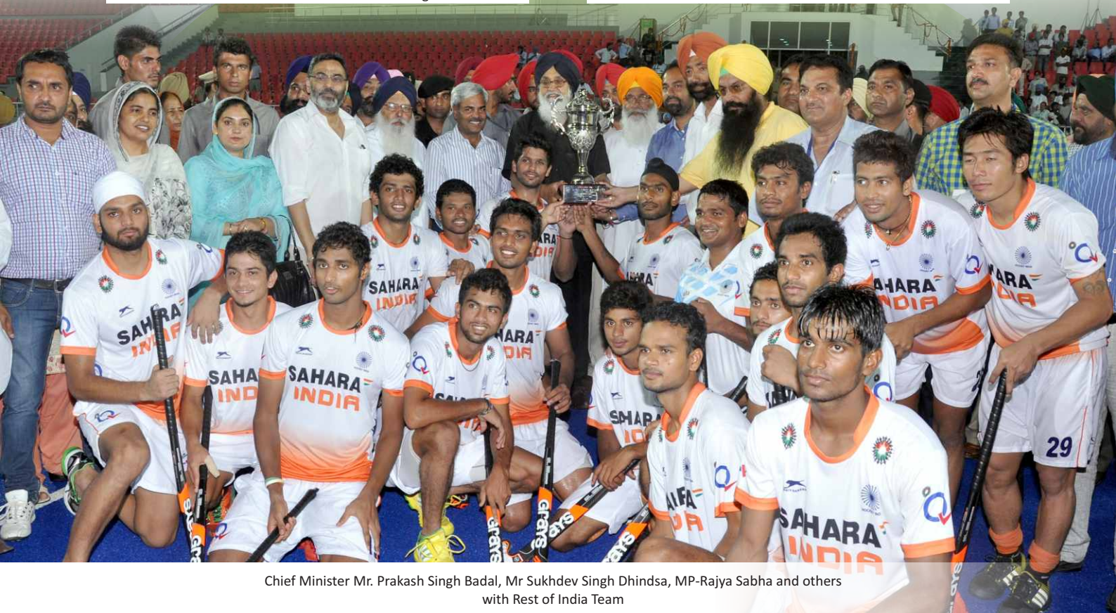
Chief Minister Mr. Prakash Singh Badal, Mr Sukhdev Singh Dhindsa, MP-Rajya Sabha and others with Rest of India Team