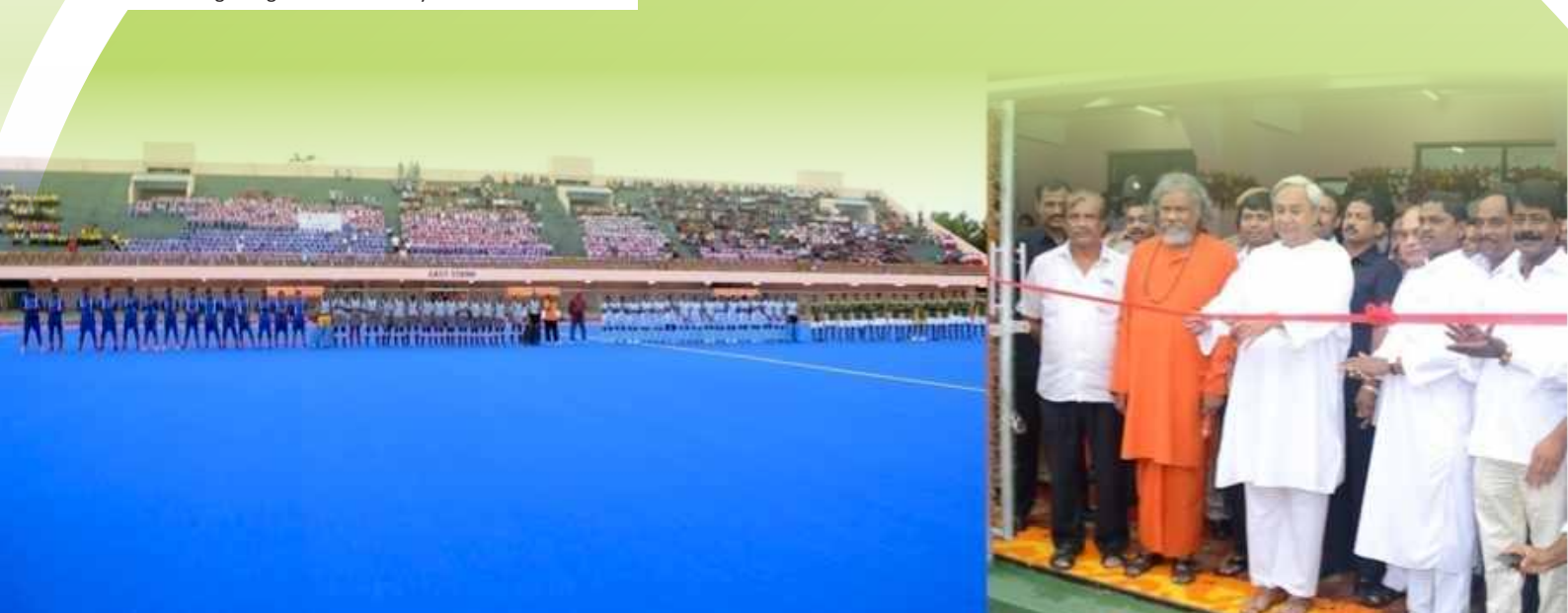
Odisha Chief Minister Mr. Naveen Patnaik inaugurating the new hockey stadium in Bhubaneswar