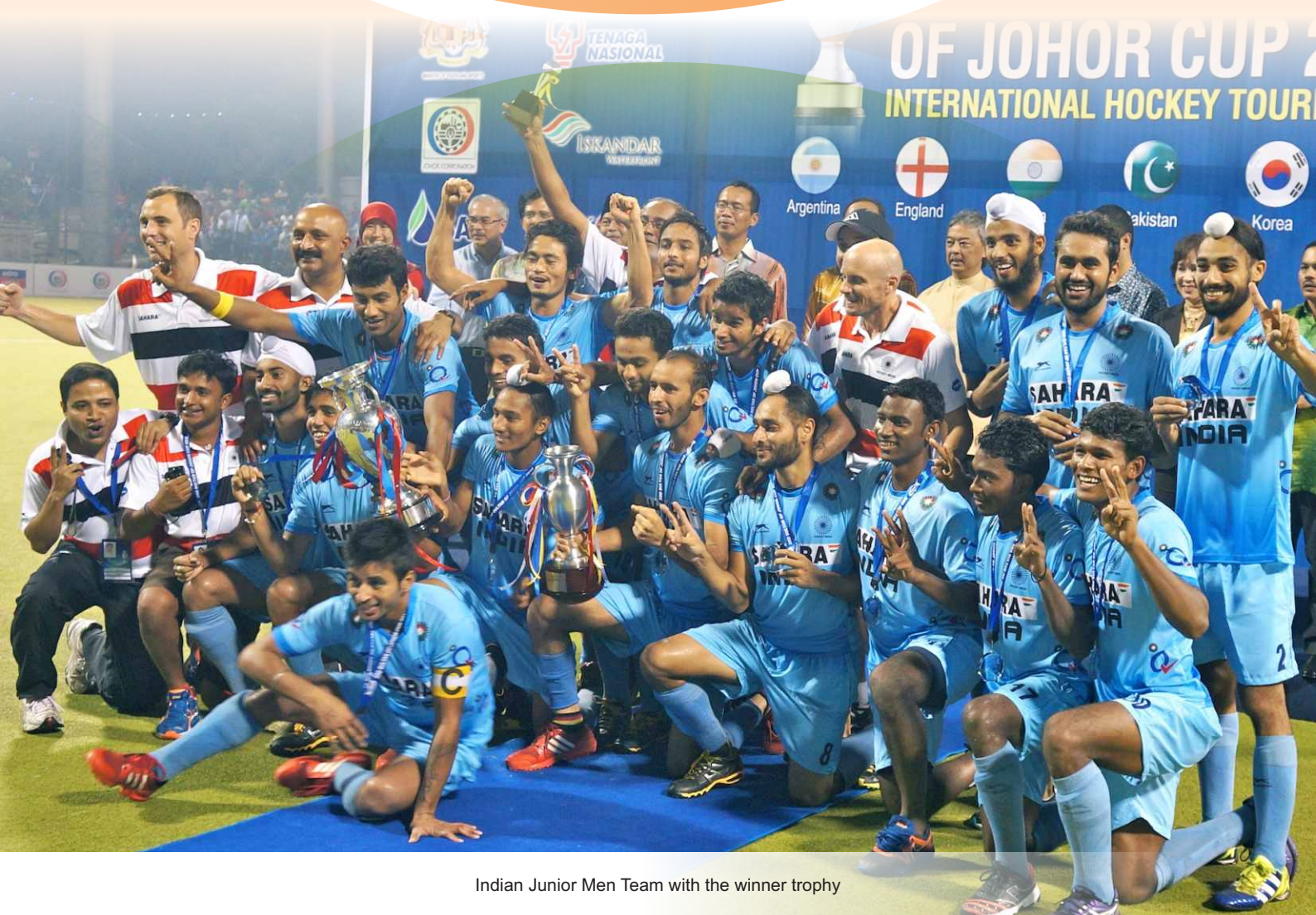
Indian Junior Men Team with the winner trophy