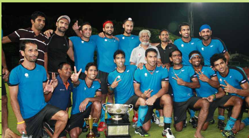
Indian Oil Corporation Ltd. with the winners trophy