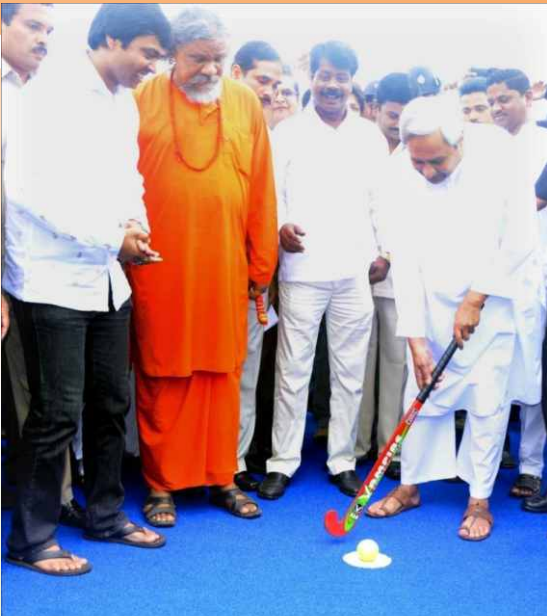
Odisha Chief Minister Mr. Naveen Patnaik with Dilip Tirkey, Member Parliament, Rajya Sabha and others during inauguration ceremony of new stadium

"It is encouraging that the state capital now has a world-class hockey turf exactly similar to the one used during the London Olympic Games 2012. This will definitely bolster the hockey infrastructure in the state," said Padmashree Dilip Tirkey, Member Parliament, Rajya Sabha.