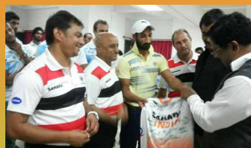
Sardar Singh, Captain of of Senior Men team presenting Jersey to Mr. Jiji Thomson, DG SAI.