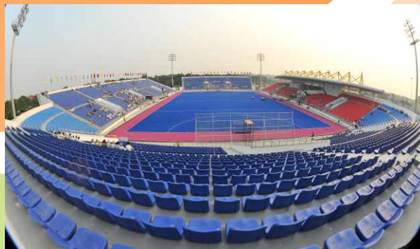
Look of newly constructed Hockey Stadium in Mohali