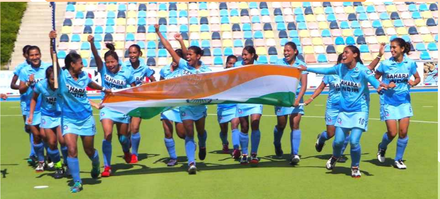
Players celebrating their victory against England with the Indian Flag.