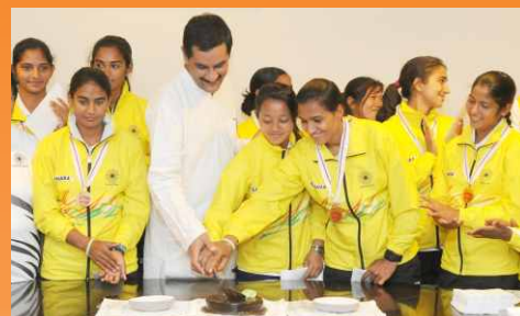
Mr. Jitendra Singh, Minister of State for Youth Affairs and Sports cuts a cake along with the members of the Junior Women Team.