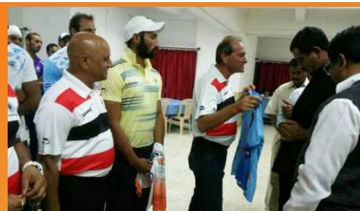
Mr. Roelant Oltmans, Interim Coach of Senior Men team presenting Jersey of the Indian team to Mr. Jitendra Singh, Minister of State for Youth Affairs & Sports