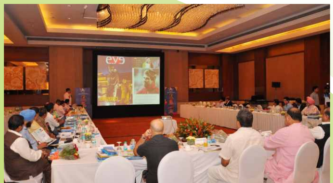
Hero HIL Presentation to Franchise representatives