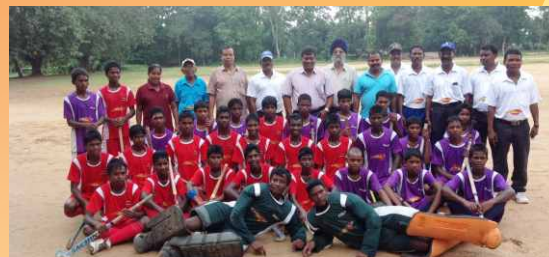
Finalist Teams of the Ranchi Rhinos League