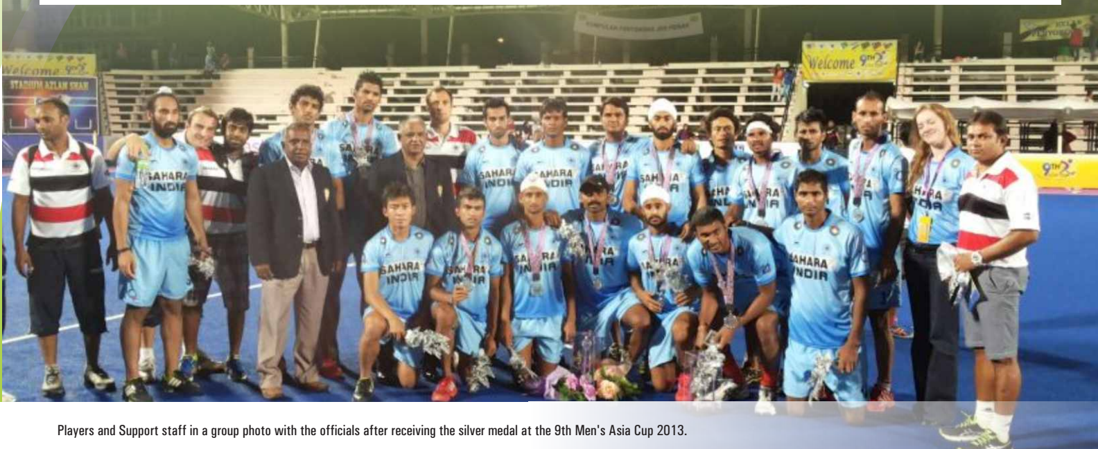
Players and Support staff in a group photo with the officials after receiving the silver medal at the 9th Men's Asia Cup 2013.