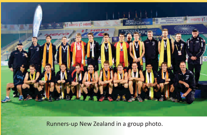
Runners-up New Zealand in a group photo.