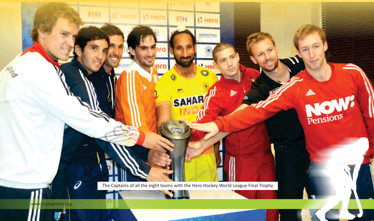
The Captains of all the eight teams with the Hero Hockey World League Final Trophy