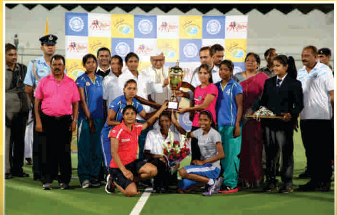
Mr. Ram Naresh Yadav, Governor of Madhya Pradesh presenting trophy to Jharkhand who finishes third in the championship