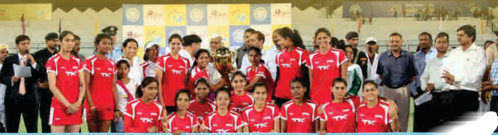
The winners Railways Celebrating with the trophy