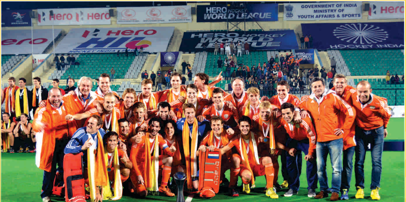
The Netherlands celebrating with the winner's trophy.

In the 3/4th position play-off, England overcame Australia 2-1 to win bronze medal in the tournament.