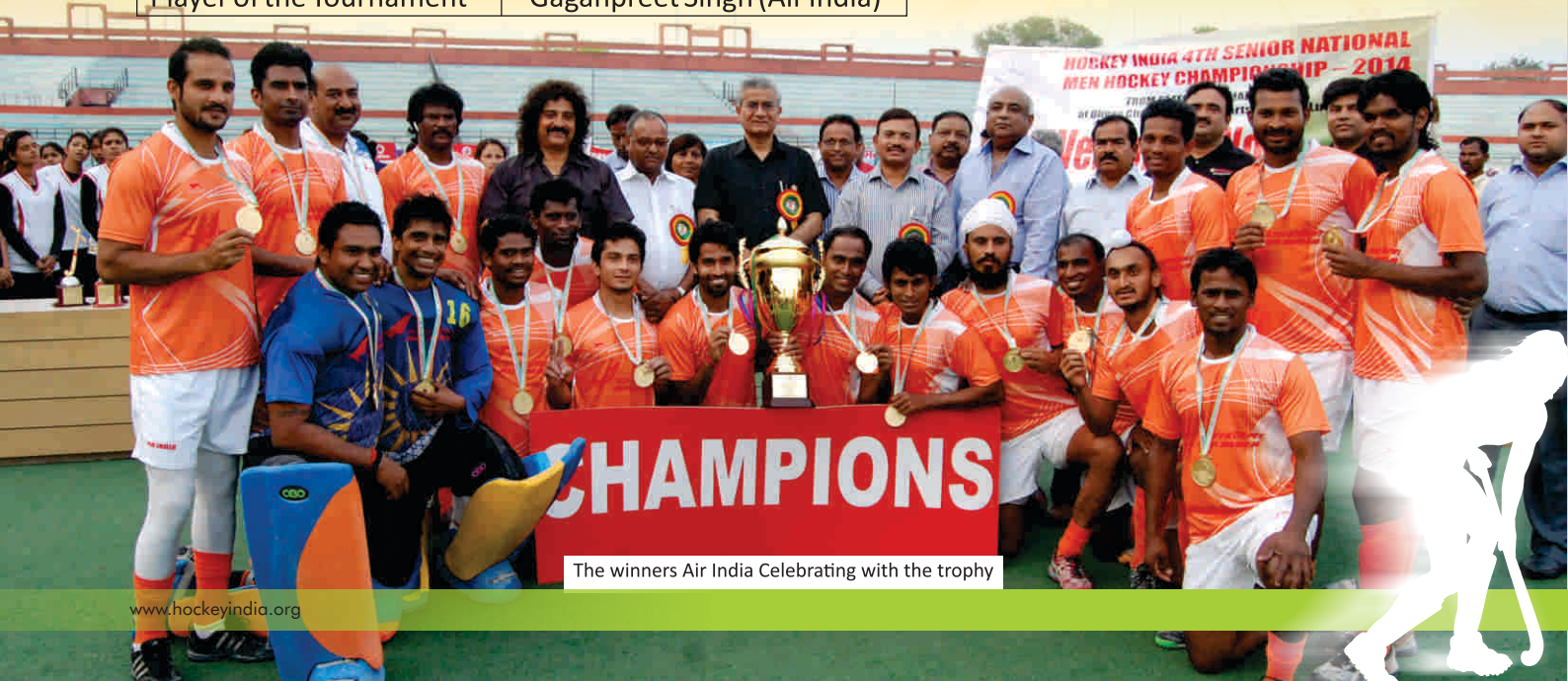
The winners Air India Celebrating with the trophy