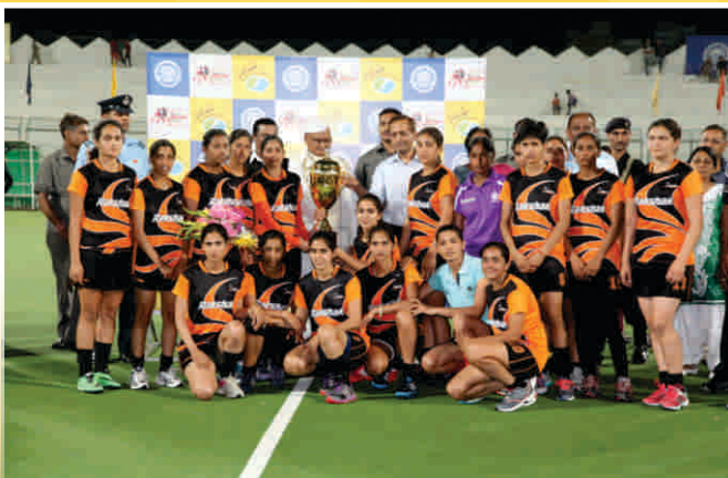
Mr. Ram Naresh Yadav, Governor of Madhya Pradesh presenting Runners-up trophy to Haryana