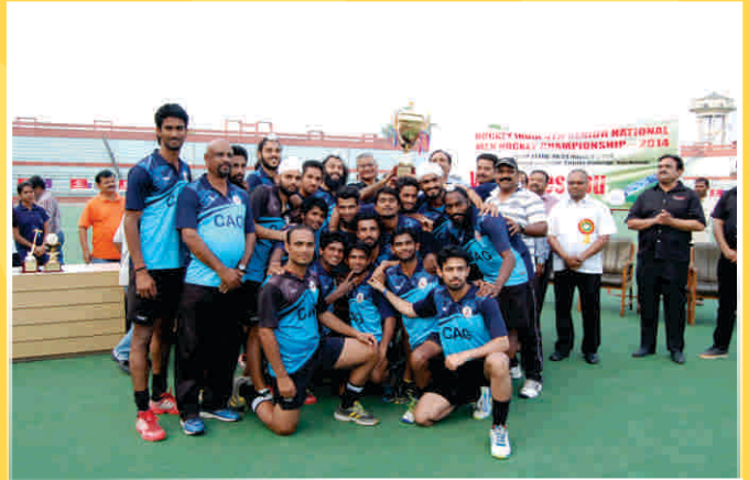
Comptroller & Auditor General of India celebrating with the Runners-up trophy.