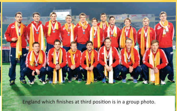
England which finishes at third position is in a group photo.