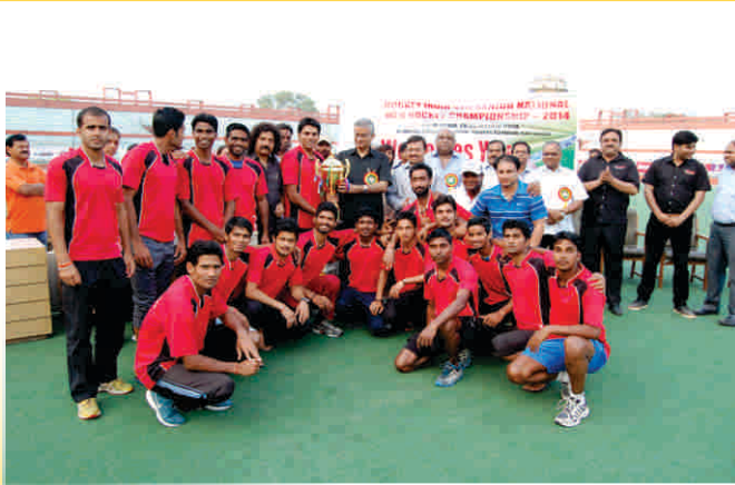
Uttar Pradesh team which finishes third is celebrating with the trophy